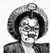
"Man-Beast from Borneo" Captured on "your recent expedition."