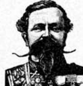
"Admiral on the Skids" Knows many a bawdy shanty!