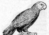
"The Vulgar Parrot" Knows 78 Different Curses!

All Our "SWELL FELLOWS" Are GUARANTEED to keep you in GOOD HUMORS TIL THE LAST DRINK IS QUAFFED!