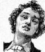
"The Crazy Poet" French or Russian accent!