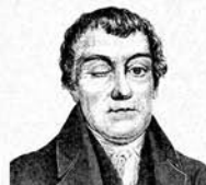
"The English Rotter" Excellent at procuring harlots!